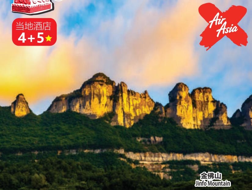
金佛山 Jinfo Mountain